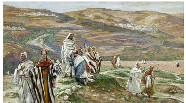
Christ Sending Out the Seventy Disciples Two by Two by James Tissot